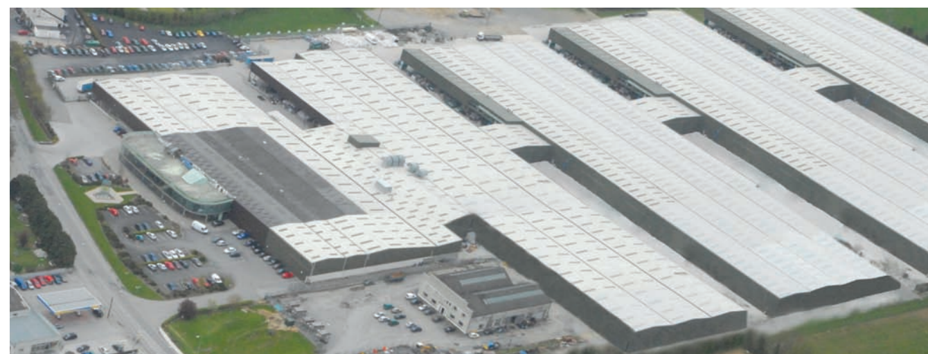
The Carey Glass plant, Nenagh, Co. Tipperary, Ireland.